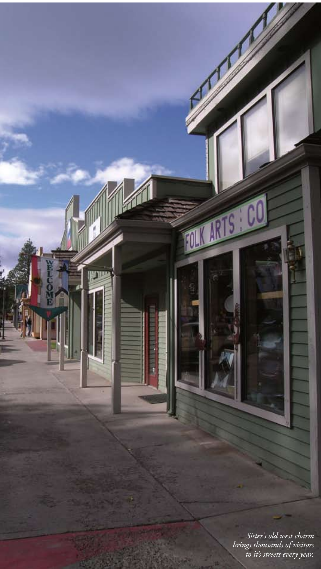
Sister's old west charm brings thousands of visitors to its streets every year.