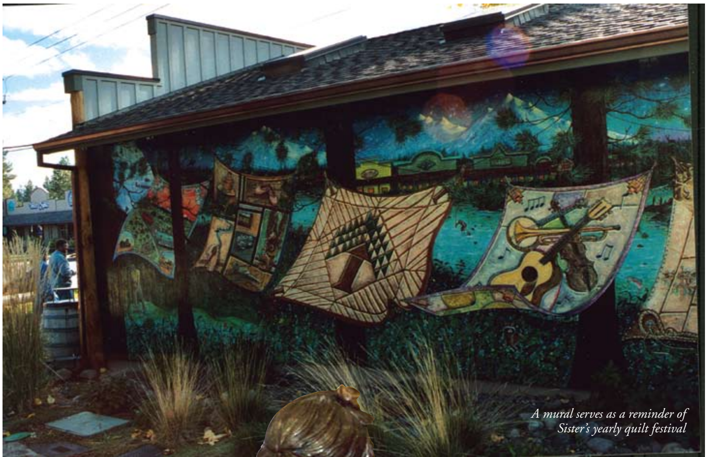
A mural serves as a reminder of Sister's yearly quilt festival

“We are really enjoying Sisters and the small town feel. This town is so small—1,490 people—and so much is going on.”